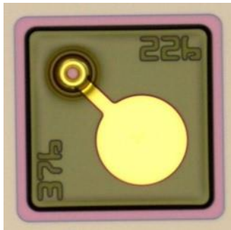
A TYPICAL WAFER PROBER TESTED VCSEL